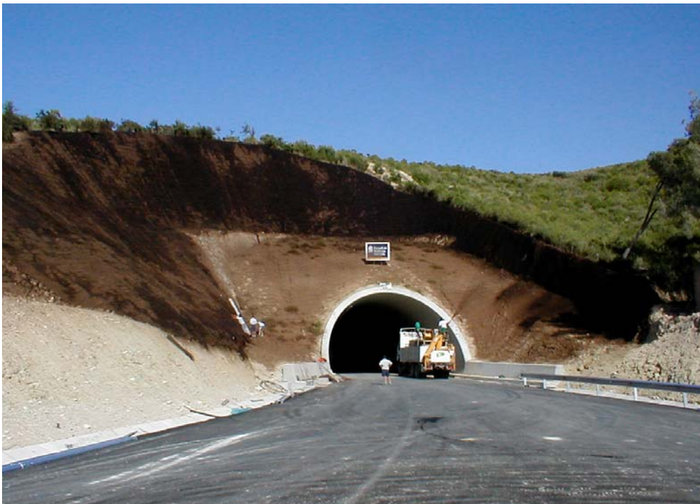
4. Spraying substrate for filling in the TRINTER mesh. Hydroseeding treatment □ □