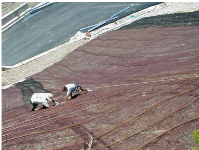
2. Drip watering system installation