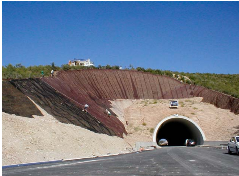
1. TRINTER volumetric mesh installation process